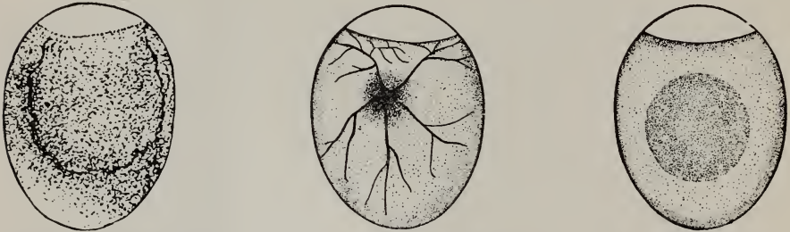
Dead germ, seventh day.

Testing. —Test on the seventh and fourteenth days, at night when the cooling is done. The first test will remove all infertile eggs and dead germ eggs up to that period. The infertile eggs are still perfectly good and can be used for cooking. The writer has known them to be so used and considers them as good as cold-storage eggs for cooking purposes. The dead germs at the seventh-day test contain either blood clots or blood rings. Every egg in which a dark movable