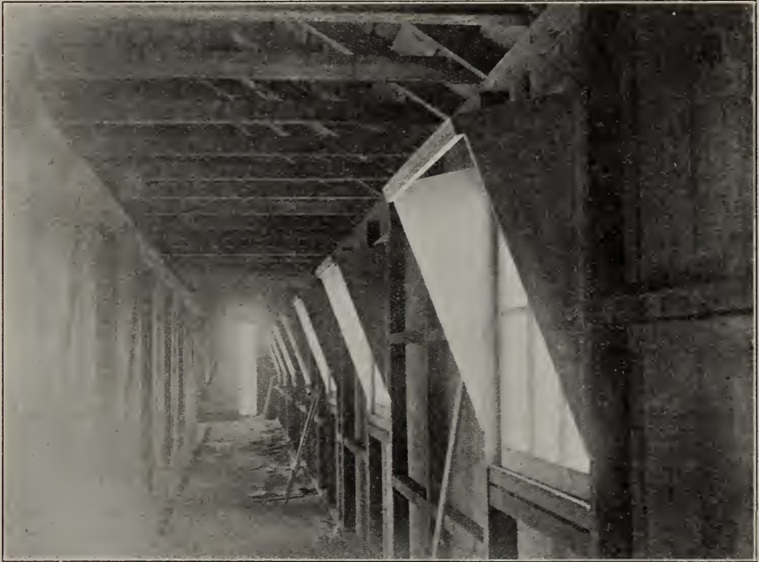
Fig. 1.—Interior of a brooder house showing how wooden shields are used at sides of windows to divert all incoming fresh air over tops of windows when open. Windows open inward at top.

Having located the incubator, level it with a spirit level. Leveling is very important, for if the machine is not level, one part of the egg tray will be higher than another, and the eggs in that part will therefore obtain more heat than the others.